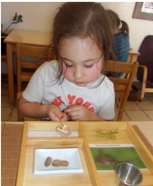
Exploring the Praying Mantis life cycle including the exo-skeleton found on the playground.

Students are enjoying being together and we're looking forward to our second quarter!