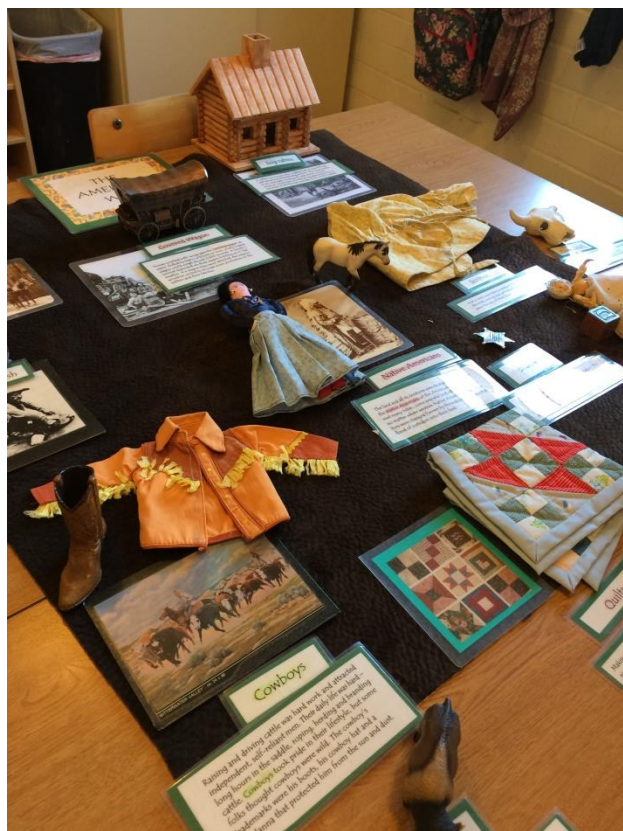
Pioneer Basket in Lower Elem

Fourth and 5 th grade Math students are finishing up their study on Fractions, and will soon be working with Decimals and Pre-Algebra concepts. Third-graders are beginning their study of Fractions, and students of all grade levels have been studying the Order of Operations and Word Puzzles.