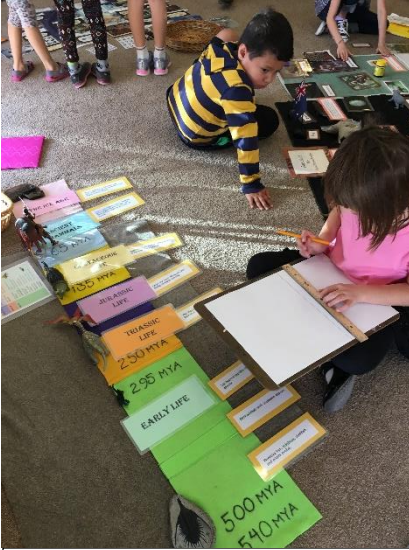
Lower Elementary studying the Ice Age Timeline .

We have also been doing a lot of Writing , composing full sentences that reflect our real knowledge and writing our first Poetry of the year. I am always amazed at our young poets. They seem to instinctively grasp that poetry has its own elegance and beauty and can be written about anything at all that is meaningful to them.