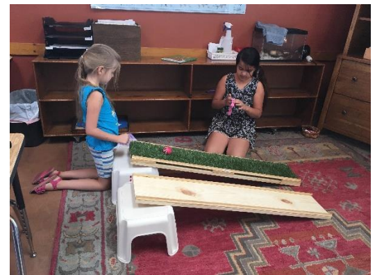
Upper Elementary students testing friction via The Scientific Method .

We have just wrapped up Arizona as our first Geography unit and are now studying the USA . UE students have been working with beautiful State Baskets ,